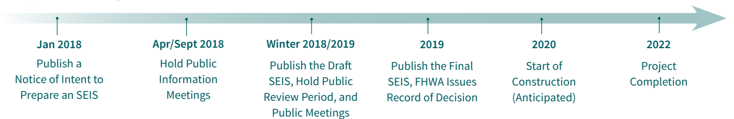
Figure 1. SEIS, Design, and Construction Schedule

Because the GSB is eligible for listing in the National Register of Historic Places, the decision-making process must also