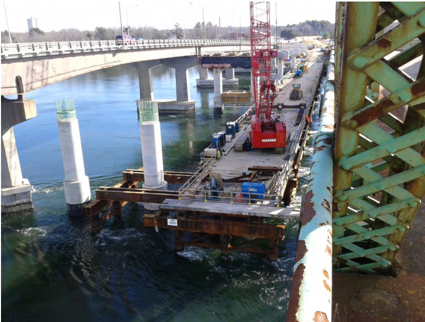
Removal of Trestle Finger at Pier 4.