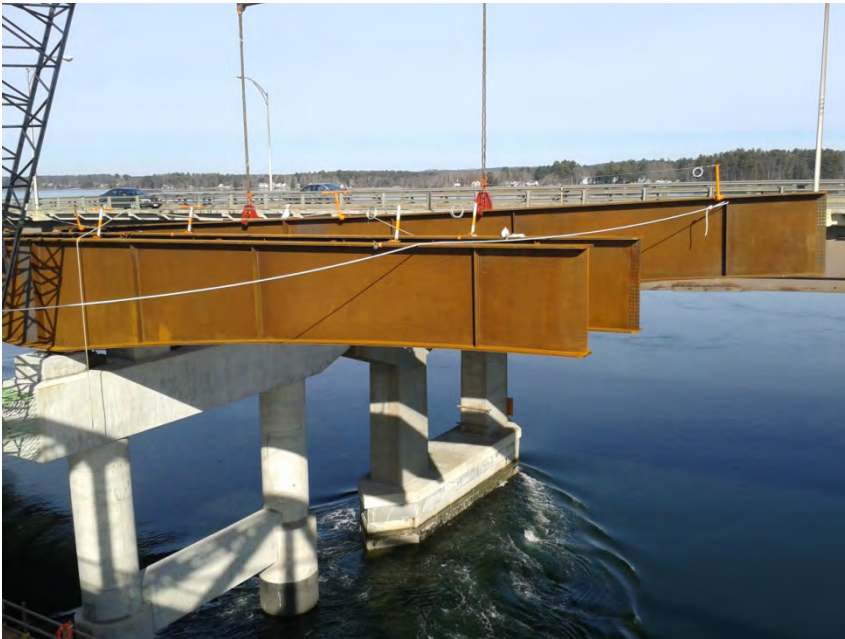
End of Phase 1 girders at Pier 5