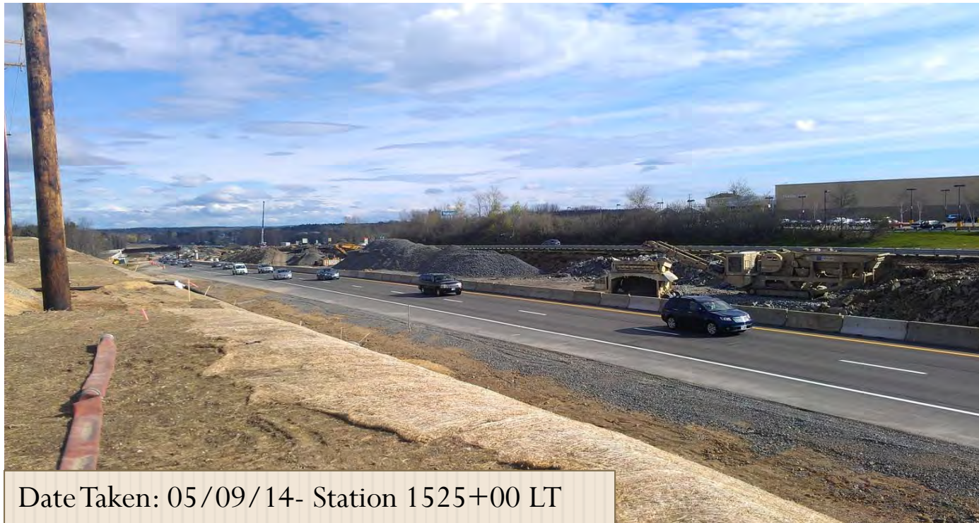
Date Taken: 05/09/14- Station 1525+00 LT

Blasting of the old southbound barrel has been completed. Coleman has been processing the blasted rock to use in the construction of the new roadway. Drainage is currently being installed through this area followed by road box construction , and paving. The northbound traffic switch will be completed this Fall.