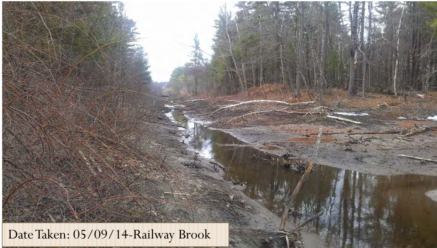
Date Taken: 05/09/14-Railway Brook

The fluvial geomorphic restoration of Railway Brook will tentatively begin summer 2014 pending a successful review of the sequencing plan. The restoration will be fast paced (approx. 2 months) in order to limit exposure and take full advantage of the growing season.