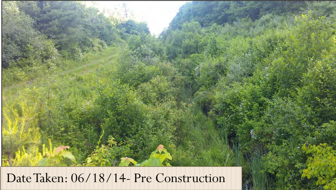
Date Taken: 06/18/14- Pre Construction

The brook is approximately half way done. Coleman will continue to work as weather permits and start back up in the spring. All final plantings will be done next spring.