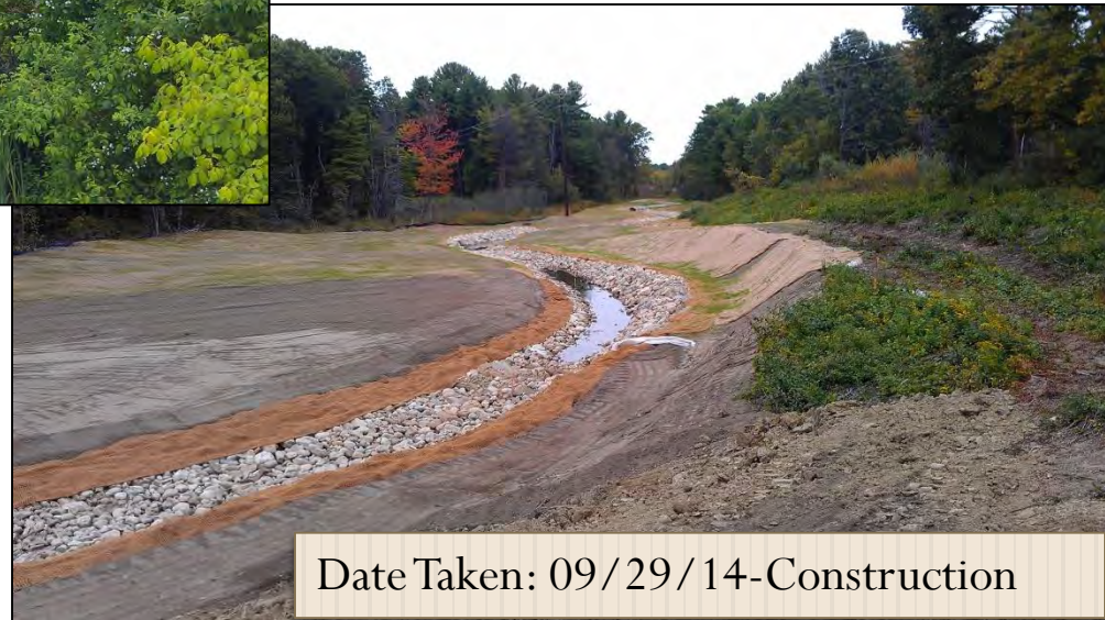
Date Taken: 09/29/14-Construction