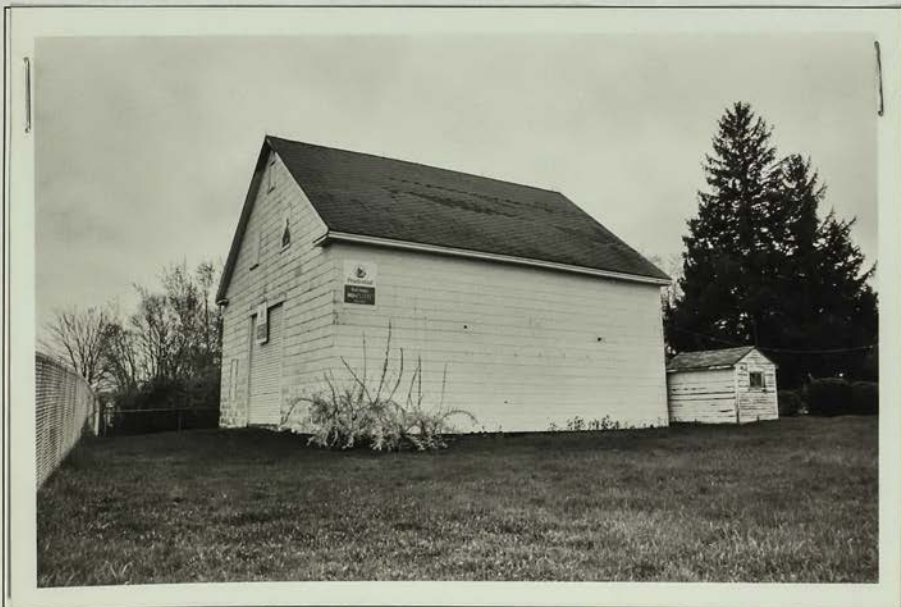
Photo 5: barn, rear (northeast) and side (northwest) elevations; shed (at right)