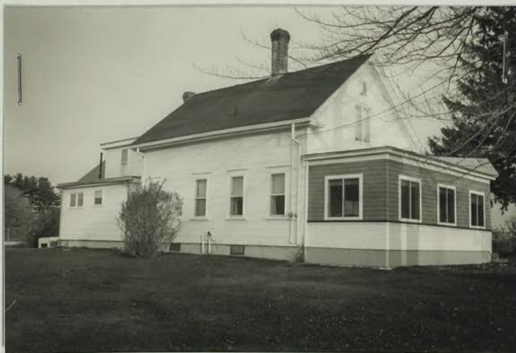
Photo 7: façade and side (northwest) elevation Roll: 1991-4 Frame: 5 Direction: SE