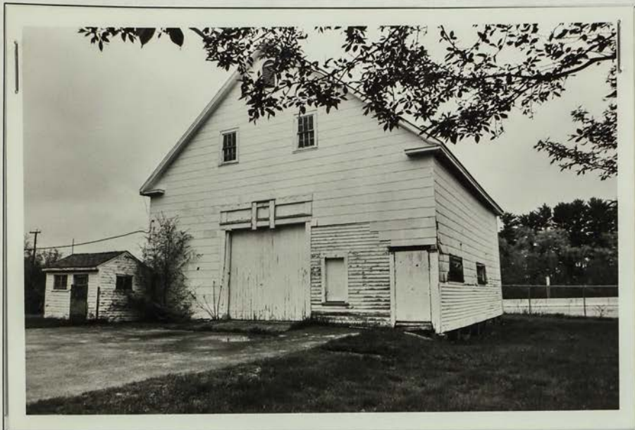
Photo 4: barn, façade and side (southeast) elevation; shed (at left)

Address: 430 Dover Point Road Date taken: May 2003 Negative stored at: NHDHR