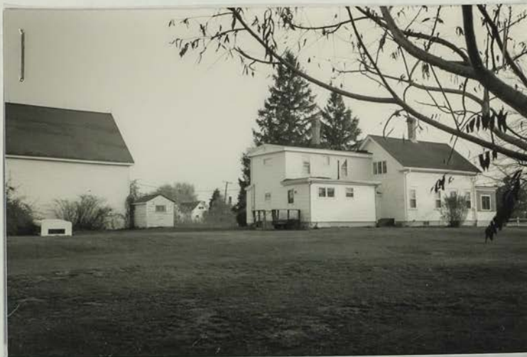
Photo 8: barn (left), shed (center), house (right; rear and side elevations)

Address: 430 Dover Point Road Date taken: November 1991 Negative stored at: NHDHR