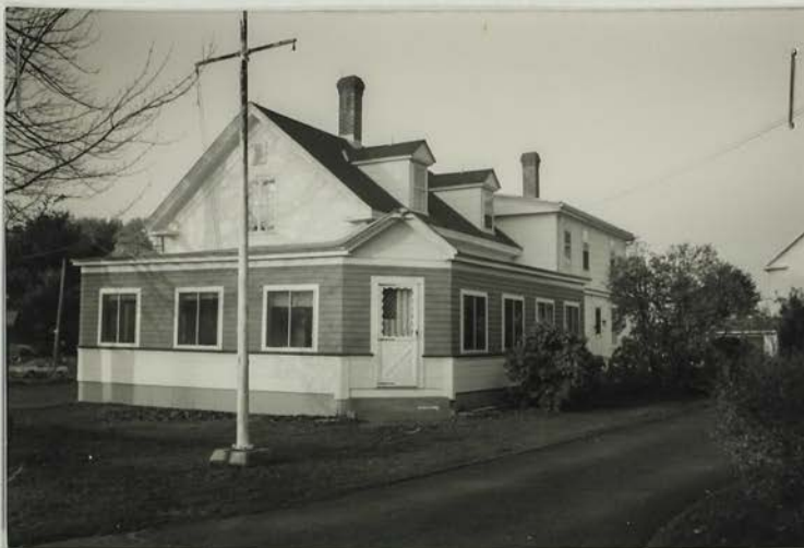
Photo 6: façade and side (southeast) elevation Roll: 1991-4 Frame: 7 Direction: NE

Address: 430 Dover Point Road Date taken: November 1991 Negative stored at: NHDHR